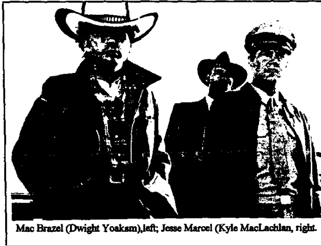
Mac Brazel (Dwight Yoakam), left; Jesse Marcel (Kyle MacLachlan, right).

"What was the story that led to the military announcing that they had a flying saucer... what led to them denying that they had one... why did so many military people who were involved keep their silence on this for the better part of their lives... and why did so many begin to speak out later?"